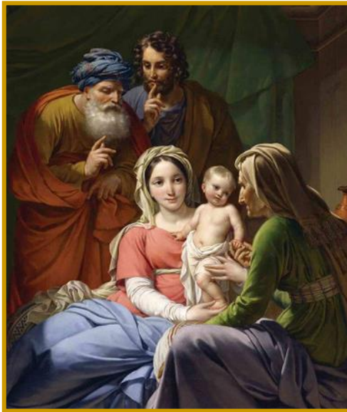
Jesus with his parents and grandparents Joachim and Anne.

Grandparents Day Sunday, July 24th has been designated by Pope Francis as the "Second World Day for Grandparents and the Elderly." The theme this year is "In old age they will still bear fruit." (Psalm 92:15) This is a reminder