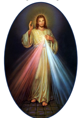
Jesus I trust in you