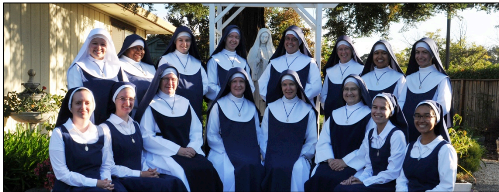
Marian Sisters of Santa Rosa